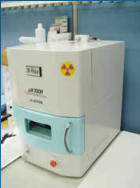
X-ray inspection. (Matsusada Precision uB1000)

We check against fake parts at our company.