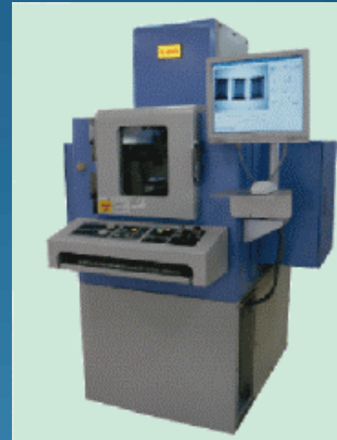
Fake Blocker-An automatic X-ray checking reel device.This is our original machine. It is also for sale.