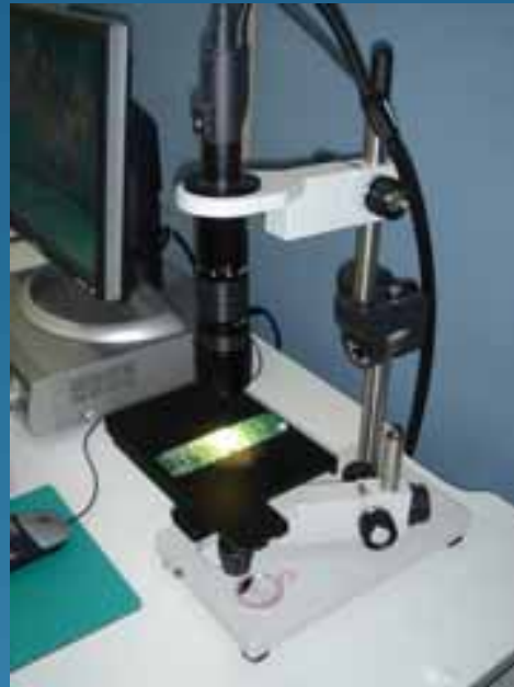
Micro-Scope 245 magnifications (Keyence:V1-1-5000)